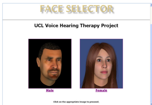
Figure 2: Front page of on-line Face Selector

The face selection procedure is based around the FaceGen© Modeller software developed by Singular Inversions. This allows a virtually infinite range of 3-D faces to be created and saved in various file formats. As a starting point in the selection, a visual array or "palette" of around 250 distinct faces was created, covering a broad range of features. The faces are chosen to cover a broad range of face types which vary in gender, age and ethnic group, as well as various common hairstyles (Figure 2).