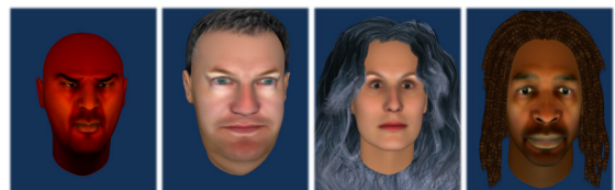
Figure 1: Samples of actual avatar characters

This paper describes a highly novel speech-technology system for delivering CBT-based therapy for auditory hallucinations, which we term Avatar Therapy. The basis of the system is a series of components for creating and operating an individualised avatar that “speaks” in the voice that the patient hears, and visually resembles the face that the patient perceives. (In cases where the patient does not clearly perceive a face, he/she is asked to choose a face which they would feel comfortable talking to). Characteristics of the avatar are chosen in consultation with each patient beforehand using a series of computerised tools. A sample set of avatar images chosen by patients is shown in Figure 1.